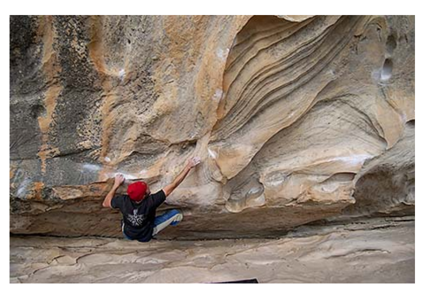
Wheel of Fortune (V12) Kindergarten